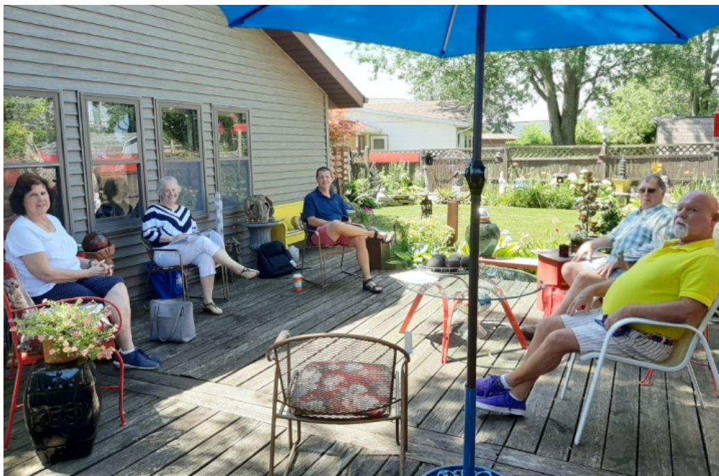
Summer Grant Committee Meeting