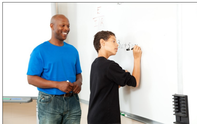
The 2018 RA passed NBI 117 which asked to the NEA to examine recruiting educators of color into the profession and into leadership roles.

Ultimately, the task force brought forward five recommendations: